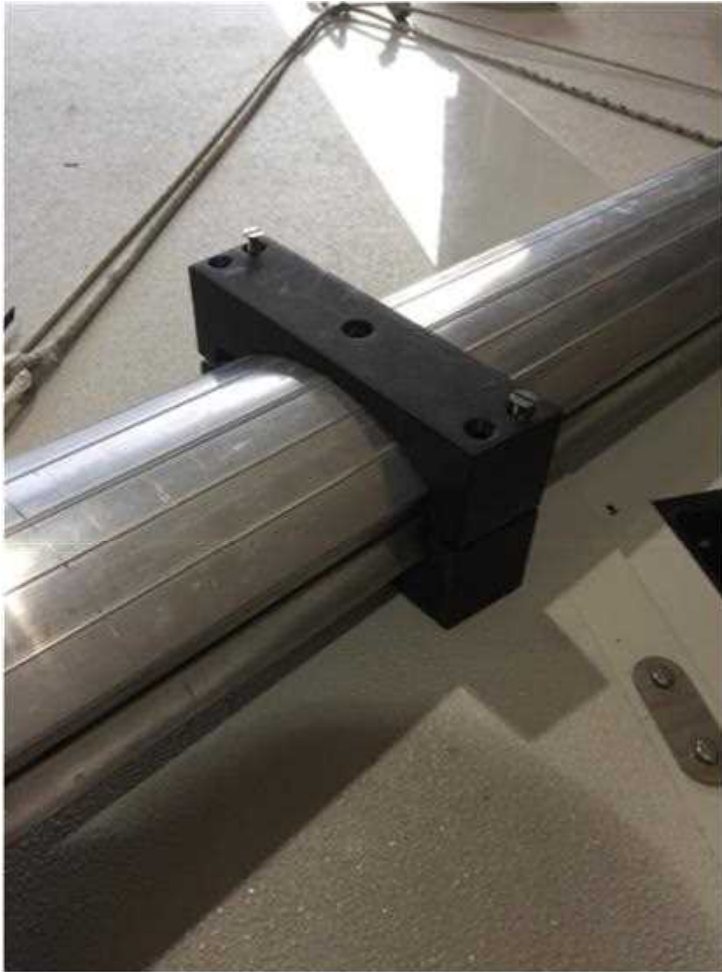
Use all four screws. DO NOT OVER TIGHTEN. You may need to adjust the height later