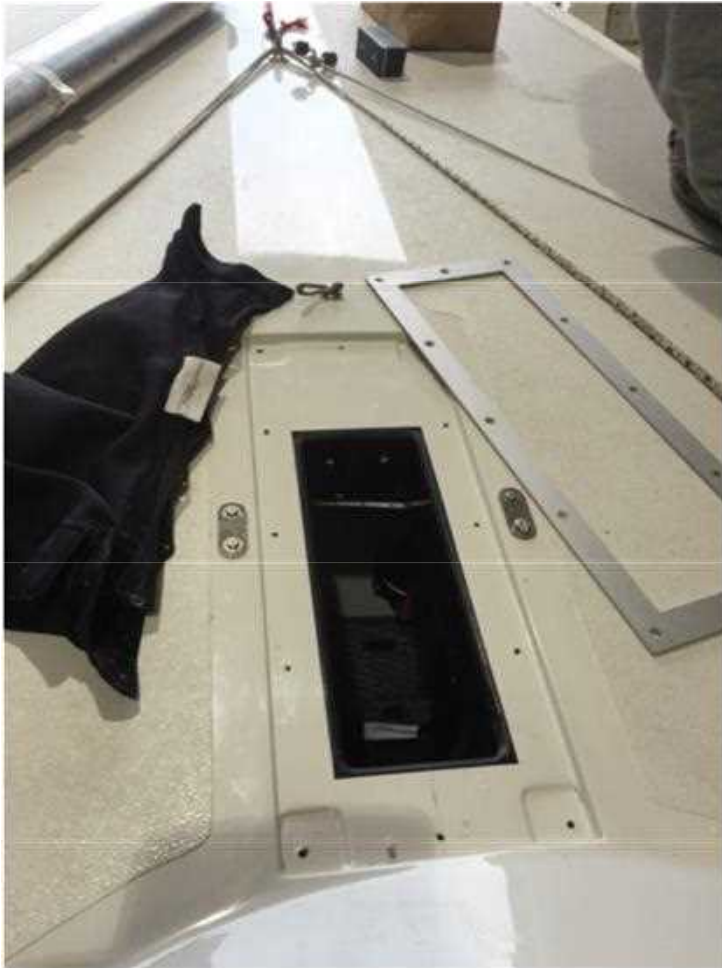
To start fitting best to remove the neoprene mast sock