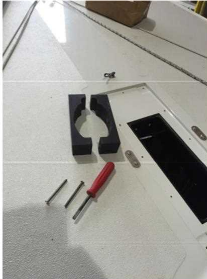
Remove existing small side chocks from the mast and clamp the new large chocks around the mast