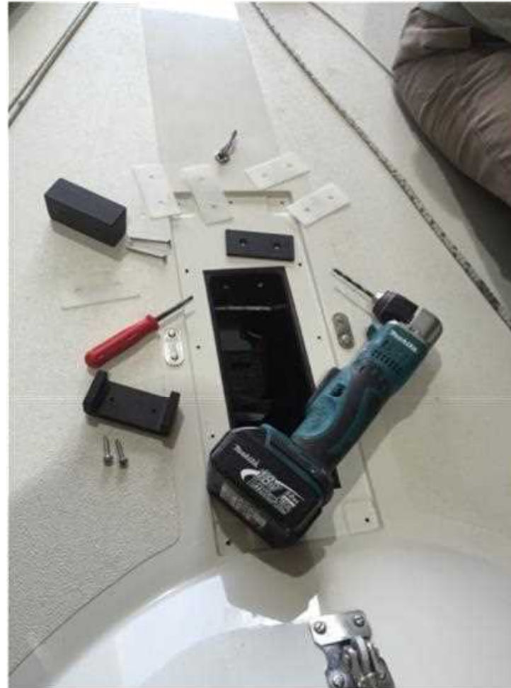
All components for the front and rear permanent deck chocks. You will need a 90 degree drilling machine.