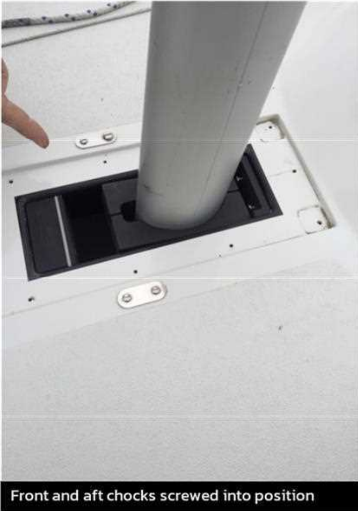
Front and aft chocks screwed into position