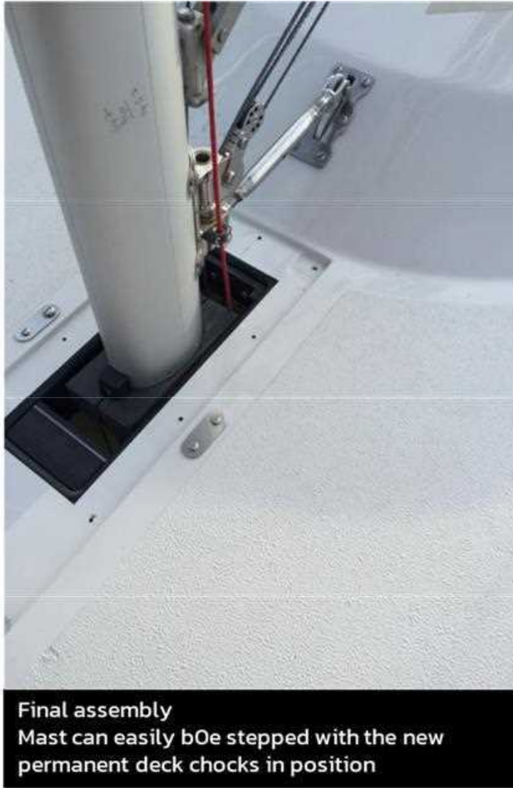
Final assembly Mast can easily be stepped with the new permanent deck chocks in position